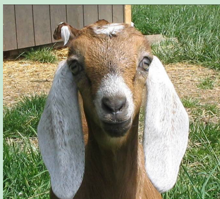
Meet Murphy, who's all smiles at Conway Family Farm!

Information coming soon to www.uaf.edu/ces and http://aksare.wikispaces.com/